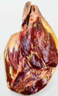
Skinned and cleaned